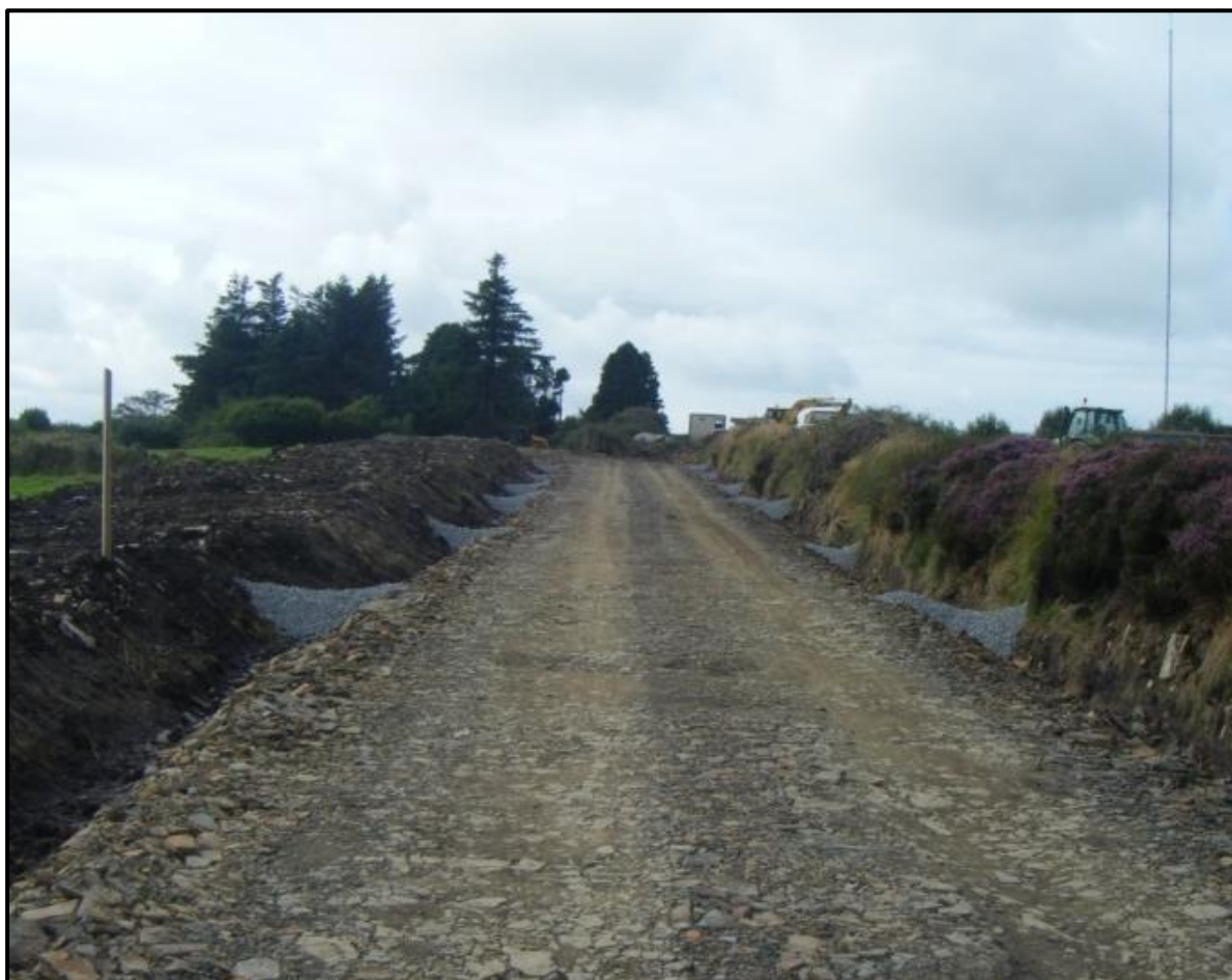
Figure 3-5: Examples of Check Dams Along Trackside Drainage Channels

Check dams will be placed at regular intervals, based on gradient, along all drains to provide flow attenuation, slow down runoff to promote settlement and to reduce scour and ditch erosion. Where access tracks have a greater than 2% gradient, check dams will be installed. Check dams are relatively small and constructed with gravel, straw bales, or other suitable material. They will be placed at appropriate intervals and heights, depending on the drain gradient, to allow small pools to develop behind them. The check dams will be constructed in stone of minimum size 37.5mm and will be laid at a spacing of between 9m and 30m dependent on slope. The bottom of the upper check dam will be at the same height as the top of lower check dam. Examples of check dam or swales are shown in Figure 3-5.