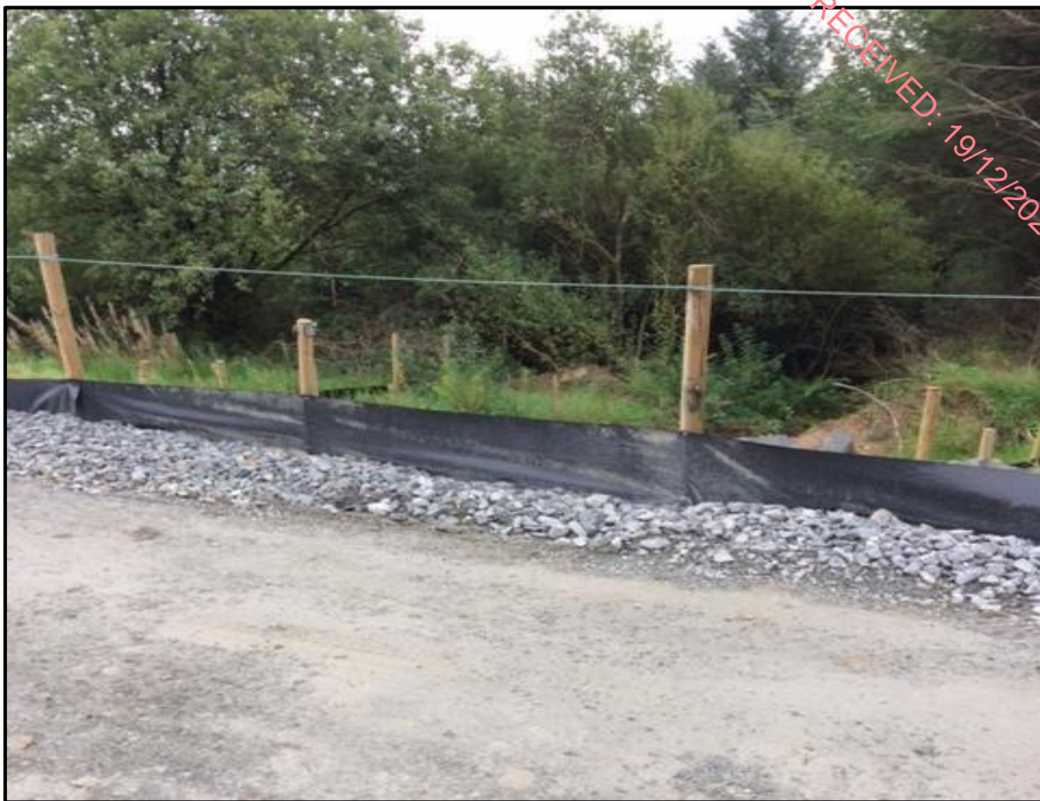
Figure 3-2: Dirty Water Containment at Watercourse Crossings