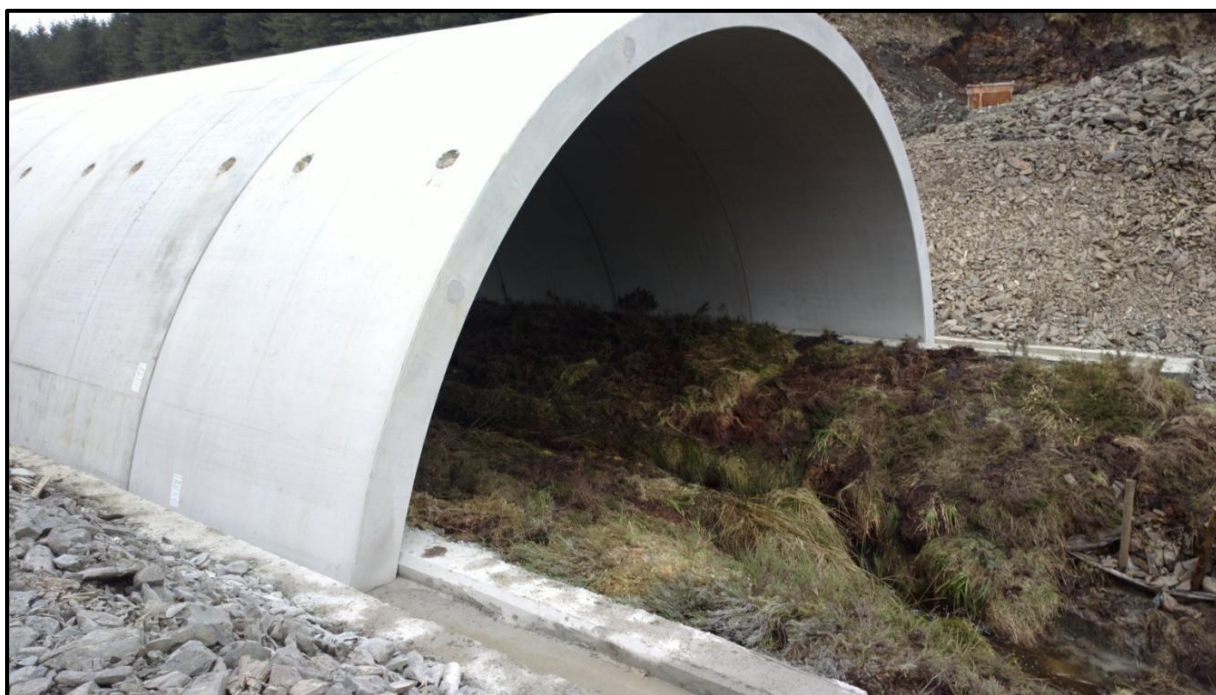
Figure 3-1: Typical Clear Span Pre-cast Concrete Units in Place Over an Existing Watercourse

Figure 3-2 shows a typical measure to be put in place at drainage and watercourse crossings to ensure dirty water does not enter clean watercourses. For the proposed development, vegetated soil bunds will be used to divert dirty water generated on the section of track over the crossings to the dirty water system. Alternatively silt curtains, will be placed along the access tracks within the 50m buffer zone. These silt curtains will run longitudinal to watercourses with a layer of stone placed along the bottom to prevent any seepage if there is a risk of silted runoff.