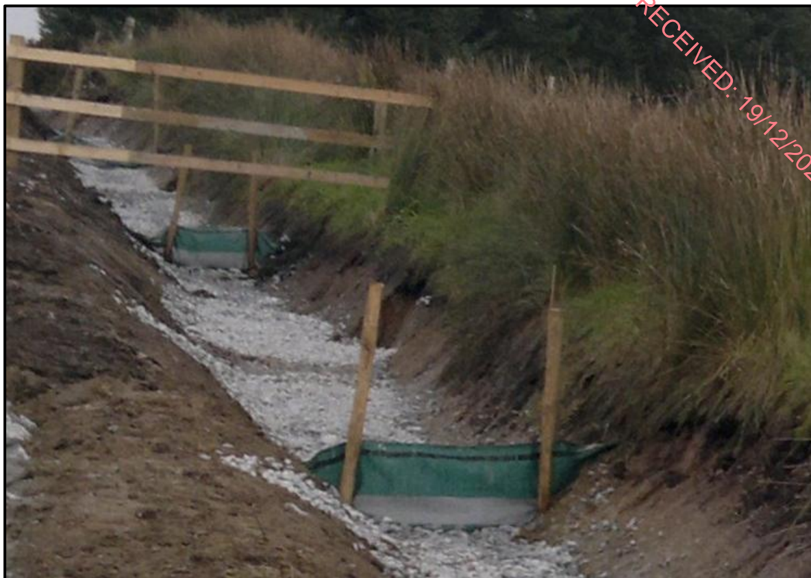
Figure 3-6: Example of a Silt Fence used in Conjunction with Check Dams Along Trackside Drainage Channels