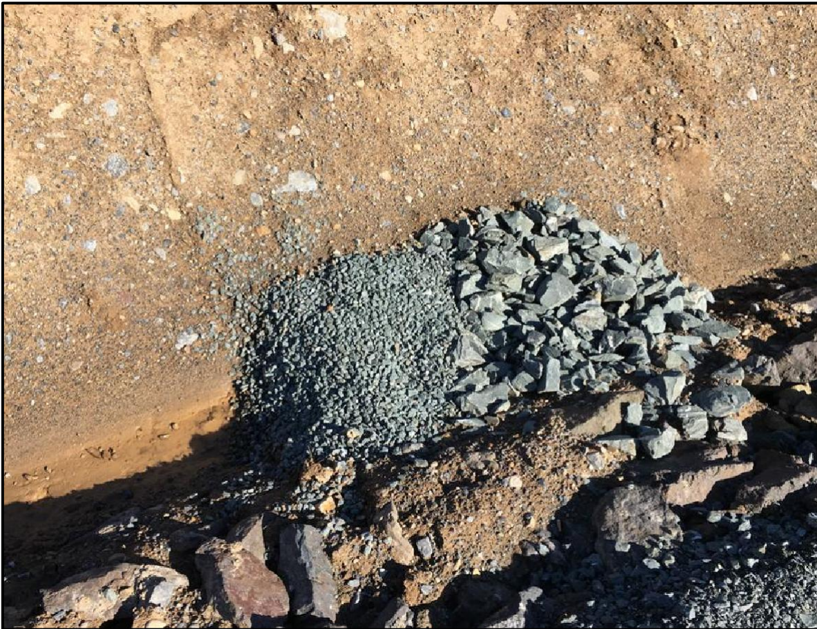
Figure 3-3: Stone Check Dam with Large Aggregate on Downstream Side

Dewatering of turbine base excavations can result in significant flow rates to the drainage and settlement system if high-capacity pumps are used. To avoid the need for pumping drainage channels, pumping from the excavations will be implemented to prevent a build-up of water. Where this is not feasible, temporary storage will be provided within the excavations and dewatering carried out at a flow rate that is within the capacity of the settlement ponds.