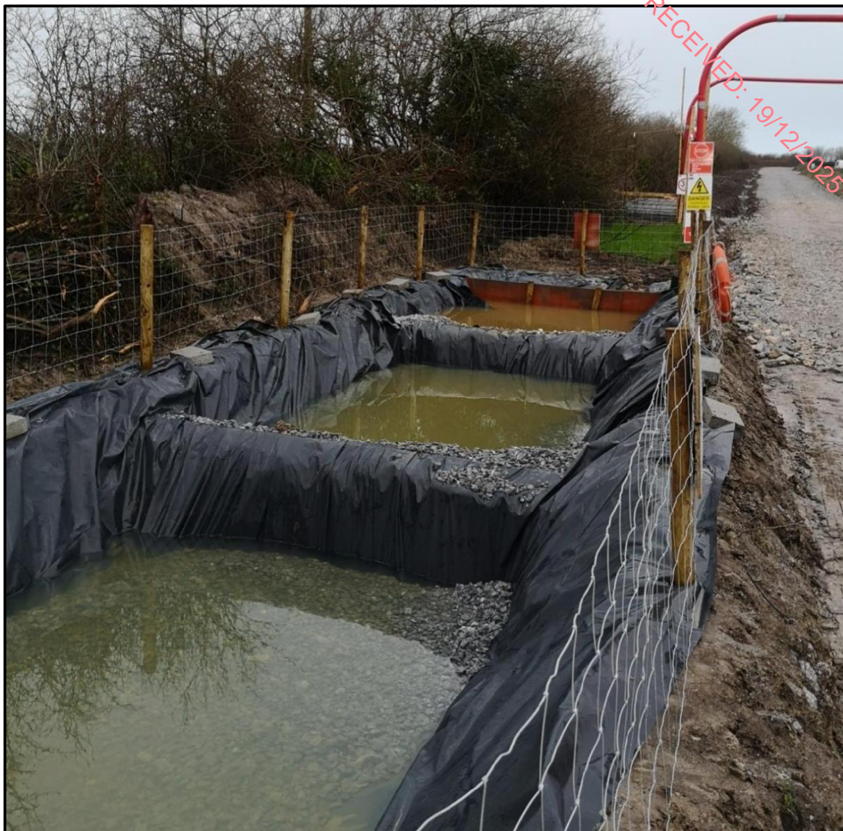
Figure 3-4: Multi-tiered Settlement Pond with Stone Filter

The design of the settlement pond system for the proposed development is detailed in the Planning Drawing 22569-MWP-00-00-DR-C-5405.